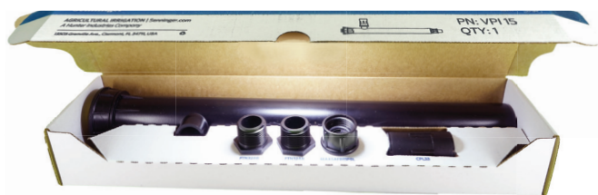
Shown above: Components per box.

While not mandatory, Teflon tape can be used on the fittings during assembly for added security. Avoid using pipe dope.